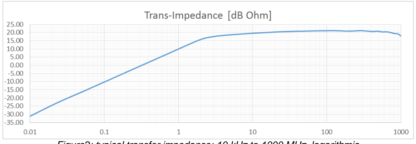
Figure2: typical transfer impedance: 10 kHz to 1000 MHz, logarithmic